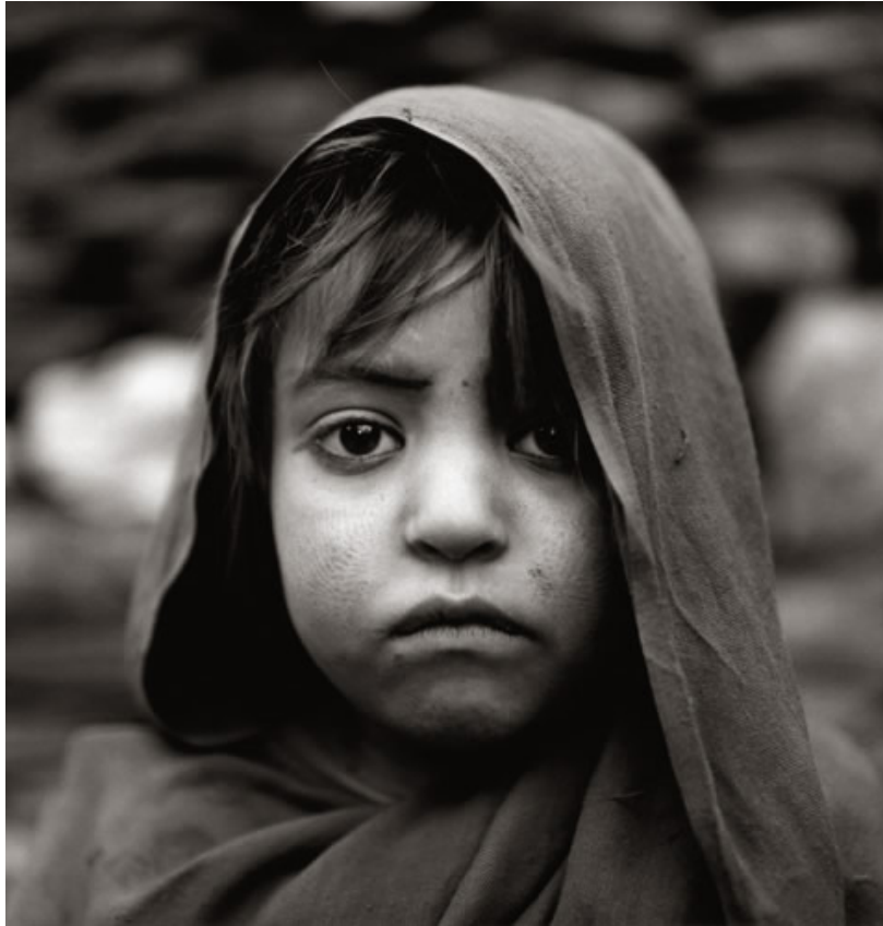
Afghan child born in exile, Afghan refugee village, Khairabad, north Pakistan, 1998

EG: Can images create "empathetic understanding?" Are there ways you could create empathy beyond image making? Have you considered means other than photography?