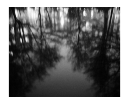
Night of Ramadan

resists alteration or change. Indeed, if water is a force of dissolution and transformation, survival and destruction, life and death, what it initiates also leaves something or someone behind. Within the world of Ramadan Moon , water is perhaps another name for leaving, which is why Sheikh's beginning is also a departure.<sup>28</sup> This departure is legible in the process of disappearance that he stages in this sequence of images—images that initiate his presentation of Seynab, even as they suggest the disappearance of