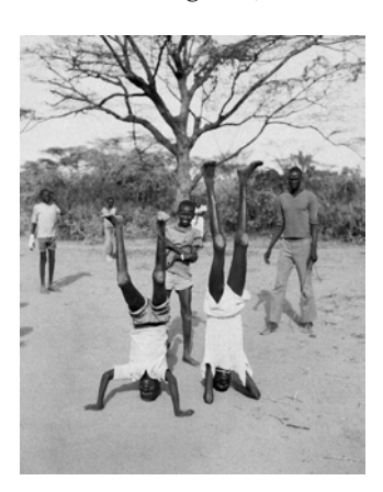
Sudanese unaccompanied minors